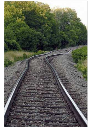
Figure 3: Buckled track