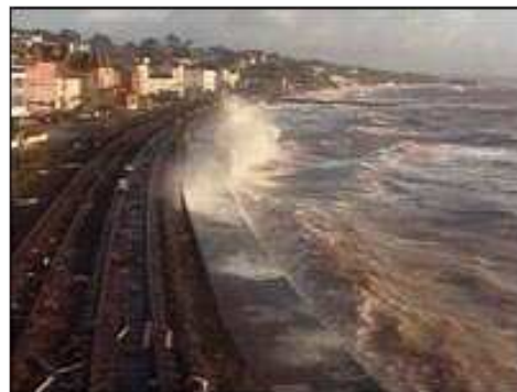
Figure 4: Sea breach on Dawlish line.