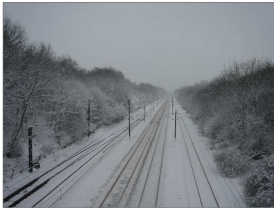
Figure 2: Effects of snow on rail track