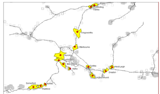
Potential station sites identified by automated search procedure