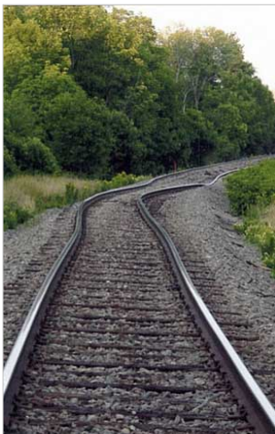
Figure 2: example of the damage caused by a buckled rail.